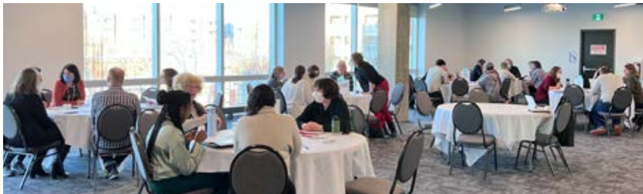
On December 9, 2022 we came together to set priorities

Our approach to exceptional undergraduate learning isn’t by accident. It’s because of our place. These beliefs infuse the way we behave and the choices that we make, and will be brought to further life as we pursue our key directions.